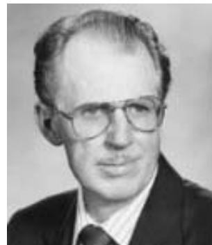
Congressman Roscoe Bartlett

anatomy and physiology to nursing students at Frederick Community College. His company later diversified into land development and home construction. Over ten years, his firm built more than 100 homes in Frederick County, many of them solar powered.